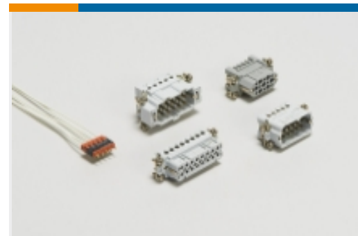
Rectangular Contact Inserts(4)