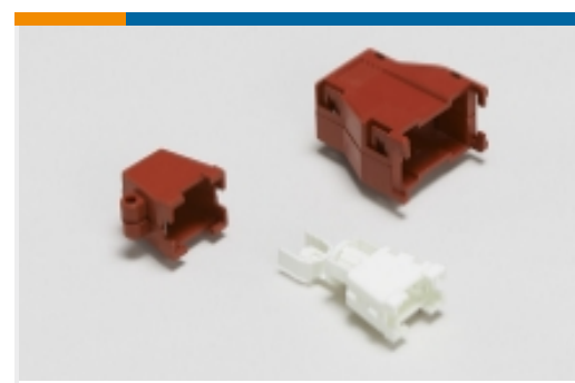
Rectangular Boots &amp; Strain Relief(5)